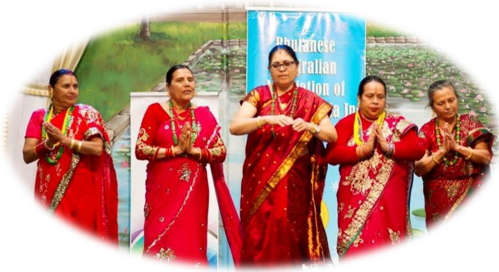
Seniors performing sangini