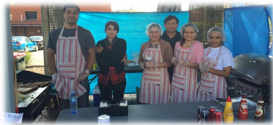
Fund Raising Event for Nepal Earthquake Victims