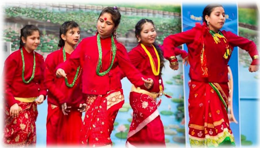
Bhutanese Ethnic School children performance